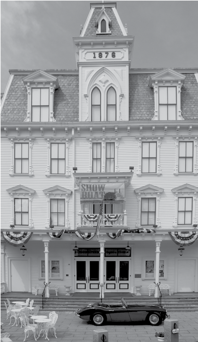
Luncheon stop in East Haddam